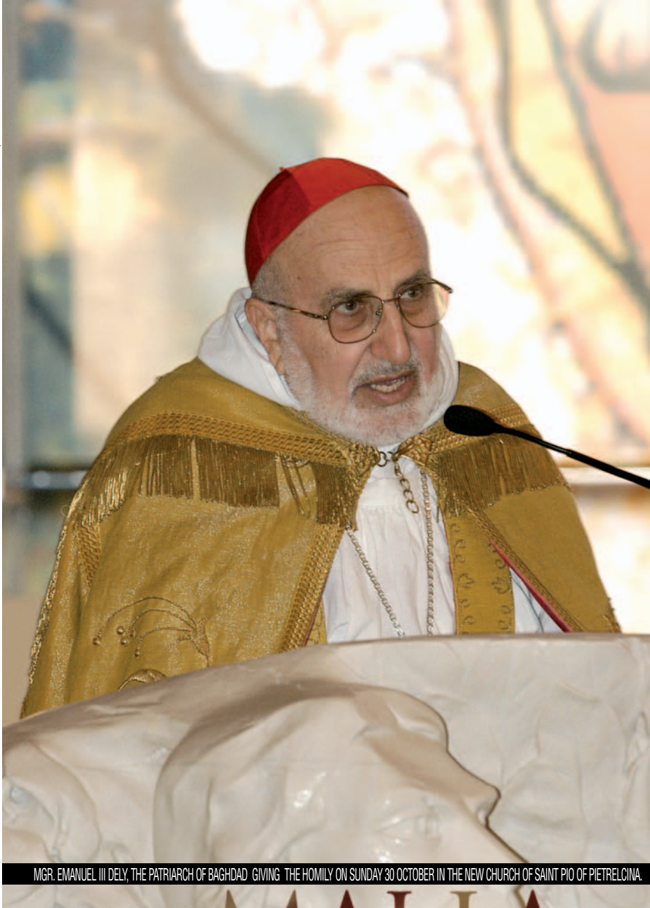
MGR. EMANUEL III DELY, THE PATRIARCH OF BAGHDAD GIVING THE HOMILY ON SUNDAY 30 OCTOBER IN THE NEW CHURCH OF SAINT PIO OF PIETRELICINA.

the present day. We have all the freedom that is necessary for a good Catholic to fulfil his duties. It is enough that we do not get involved in politics and the questions that concern the different parties.